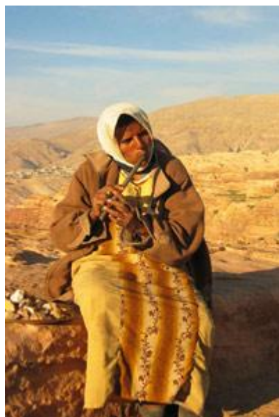
Hidden treasure vase.